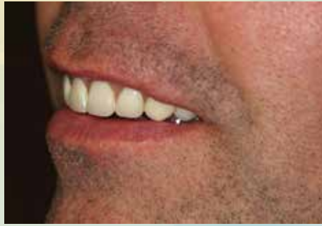
Figure 35: Left lateral view of the final prosthesis in place demonstrates the dramatically improved esthetics provided by the appliance, addressing the patient's predominant dental concerns.