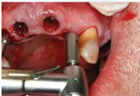
Figure 7: A tissue punch was used to provide a clean incision and access to the maxillary bone, facilitating a flapless procedure that minimized trauma to the soft tissue.