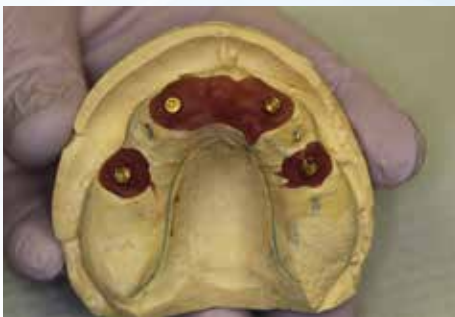
Figure 24: The laboratory removed the anchor teeth from the hard model and created a soft tissue model with the appropriate Locator abutments for fabrication of the final implant-retained prosthesis.