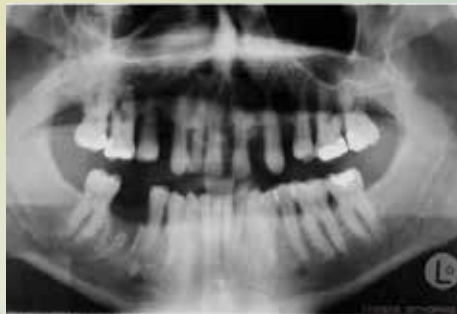
Figure 2: Panoramic radiograph indicates significant maxillary bone loss.