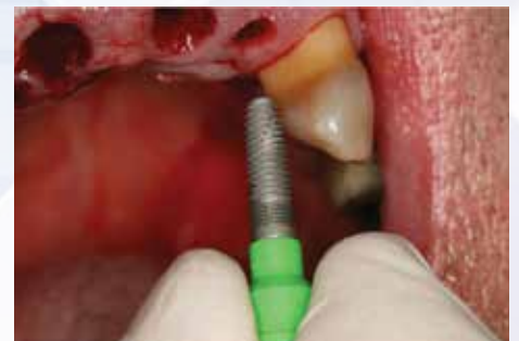
Figure 9: The first of four Inclusive Tapered Implants was initially hand threaded into place.