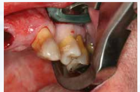
Figure 6: Several teeth along the maxilla were strategically extracted to facilitate ideal implant placement. Canines and molars were left in place to stabilize a horseshoe-shaped temporary prosthesis.