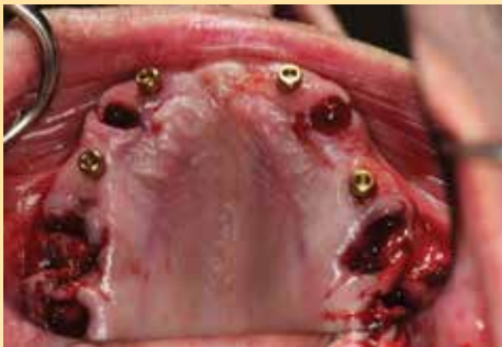
Figure 28: The remaining natural teeth were removed in preparation for delivery of the final implant-retained overdenture.