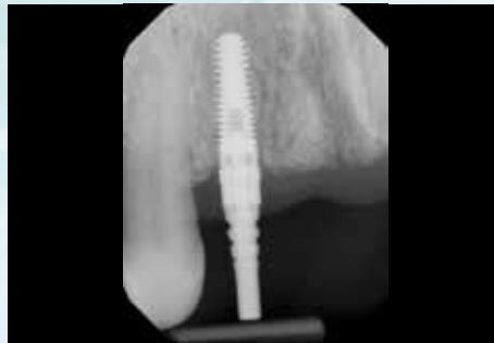
Figure 22: A radiograph was taken to verify complete seating of the impression coping.