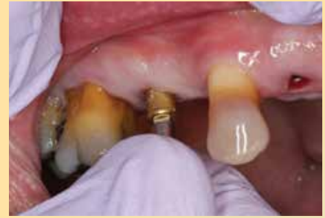
Figure 27: The Locator abutments were threaded into the implants.