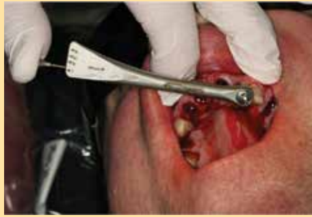
Figure 11: A torque wrench was used to torque the implant to 45 Ncm in proper position at the crest of the maxillary ridge.