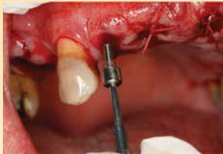
Figure 14: Healing abutments were threaded into place.