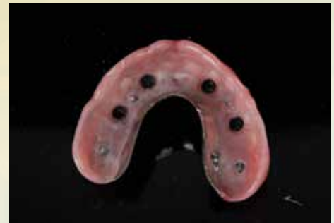
Figure 30: The final maxillary overdenture incorporated four Locator retention caps, which provide excellent prosthetic stability by affixing to the Locator abutments.