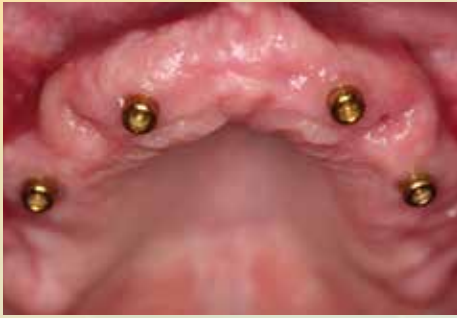
Figure 34: The maxillary ridge had healed nicely four weeks after extracting the remaining natural teeth.