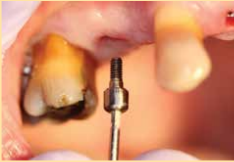
Figure 25: The healing abutments were removed from the implants.