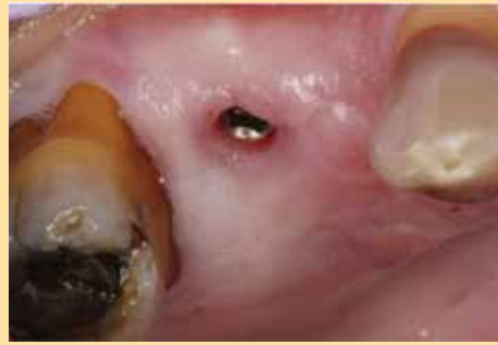
Figure 26: The peri-implant soft tissue exhibited healthy gingival cuffs upon removal of the healing abutments.