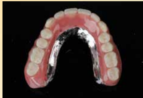
Figure 29: The final prosthesis was reinforced with metal for strength and featured a palateless design to enhance dental function, patient comfort and food-tasting capability.