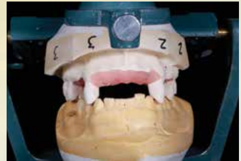
Figure 15: Prior to initial surgery, the lab fabricated and articulated casts of the maxillary and mandibular arches with only the anchor teeth in the upper arch.