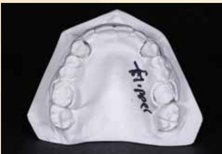
Figure 16: The lab produced a diagnostic wax-up of the maxillary arch including the anchor teeth and the partial denture, allowing for production of the temporary prosthesis prior to surgery.