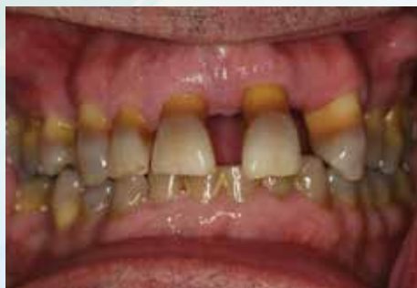
Figure 5: Retracted frontal view illustrates extremely poor esthetics resulting from severe dental decay and gingival recession.