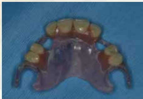
Figure 17: A transitional partial denture was fabricated, using the temporarily remaining maxillary teeth for retention.