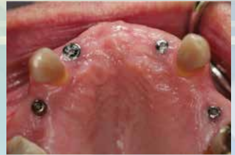
Figure 20: After approximately four months of integration, the soft tissue surrounding the implants was healthy and pink. The healing abutments, which allow for placement of impression copings without local anesthesia, were then removed.