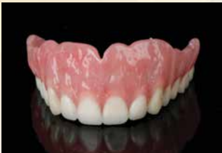
Figure 31: The lab produced the final overdenture with a high flange to accommodate the patient's thin upper lip, enhance his smile line and maximize facial support.