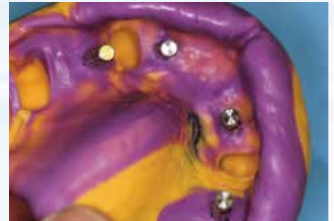
Figure 23: A final impression was taken with the remaining natural teeth in place and sent to the lab for fabrication of the final denture.