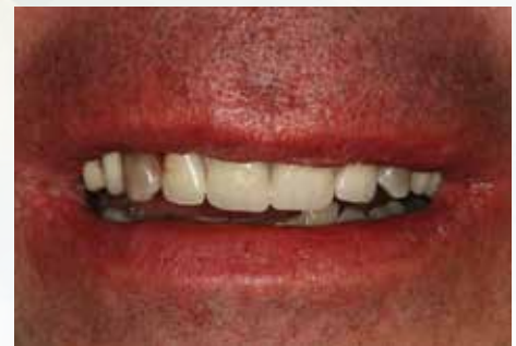
Figure 18: The provisional appliance fit the patient well and maintained speech function effectively throughout the healing phase.