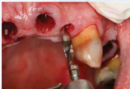
Figure 8: A series of progressively larger osteotomy burs was used to create the osteotomy site.