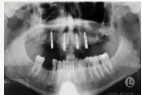
Figure 33: Panoramic radiograph of the parallel-placed implants following osseointegration.