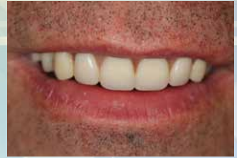
Figure 36: Frontal view exhibits the natural-looking appearance and improved smile line provided by the final implant-retained overdenture, greatly enhancing the patient's confidence.