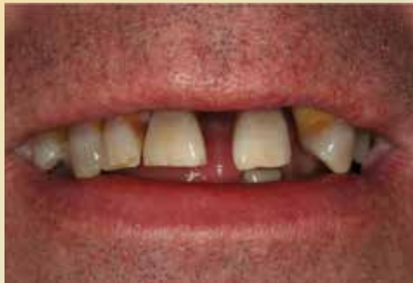
Figure 1: Preoperative smile exhibits poor oral esthetics about which the patient, a prominent educator that frequently engages in public speaking, was extremely self-conscious.