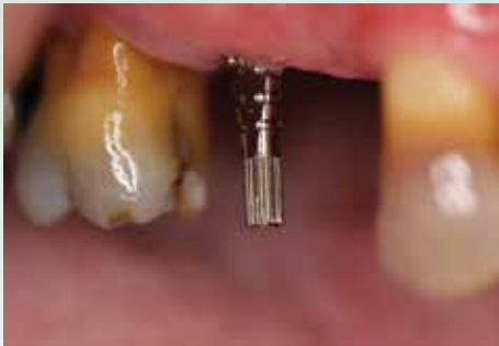
Figure 21: Impression copings were placed into the implants.