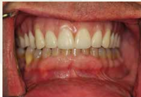
Figure 32: Retracted view of final maxillary overdenture in place, which offers long-term stability, function and support of the patient's tissue and facial structures.