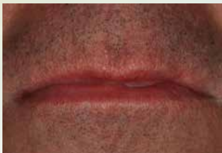
Figure 4: Closed-mouth esthetics demonstrate a thin upper lip that would make wearing a conventional denture difficult.