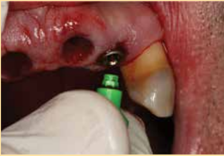
Figure 10: The implant disengaged with the plastic carrier upon reaching its torque threshold of approximately 15 Ncm.