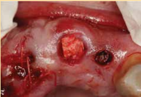
Figure 13: A non-resorbable barrier was engaged on the facial and palatal bone of the socket site prior to suturing the graft into position.