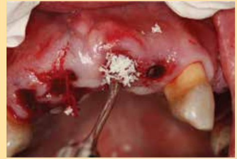
Figure 12: Cortico-cancellous bone grafting material was packed lightly into the central incisor socket site to prevent excessive bone loss.